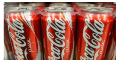
What One Can of Coke Does to Your Body in Only One Hour Yahoo Health