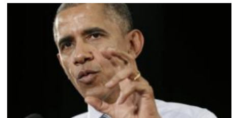
Obama touts good jobs data, but economy still in a recession? Fox Business Videos