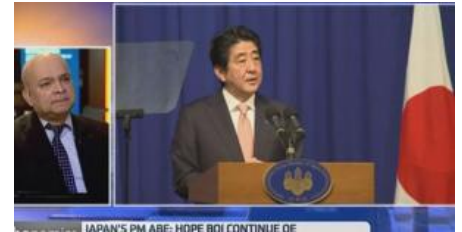
Japan exits recession: Reaction CNBC Videos