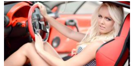
Spain's New Cash Formula Unleashed Market Traders Sponsored