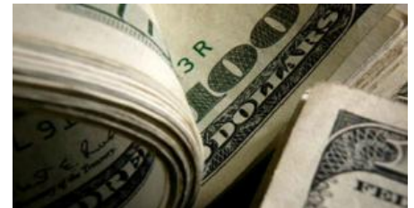
U.S. banks ready to handle a recession TouchVision