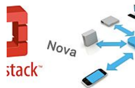
Navigating Through OpenStack Networking – The Definitive Breakdown CLOUDIFY