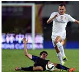
Madrid fans want Cheryshev to stay