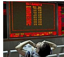
Crash continues: Chinese equity sell-off overwhelms state intervention NIKKEI ASIAN REVIEW

Get our hottest stories delivered to your inbox.