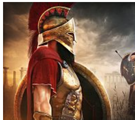
Gamers All Over The World Have Been Waiting For This Game! Finally it's here! SPARTA