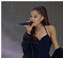
Must Watch Video: Ariana Grande's "Problem (Live At Capital Summertime Ball/2015)" VEVO