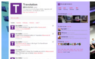
Follow Travolution on Twitter