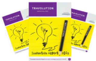
Innovation Report 2015